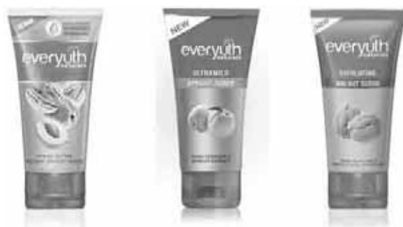
*Everyuth scrub range including “Advanced Walnut Scrub”

In the Scrub segment , Everyuth maintained its leadership position with market share of 30.7% (Source: Nielsen, MAT March 2016). Focus in 2015-16 was in establishing the new “Advanced Walnut Scrub” variant with television being the primary medium of building awareness and generating trial.