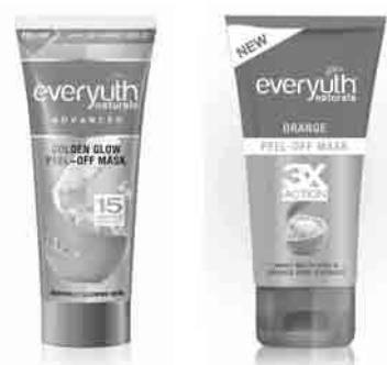
*Everyuth Peel Off range

In Peel Off segment , Everyuth had a significant turnaround in 2015-16. During the year, Peel Off segment off-take and internal growth rates have picked up significantly. The brand has restaged its Peel Off packs with new packaging and benefits. The new communication focused on special occasions has helped turnaround the performance of Everyuth and hence overall Peel Off segment. Everyuth Peel Off has maintained its number one position with a market share of 92.1 %, which is an increase of 80 basis points. (Source: Nielsen, MAT March 2016)