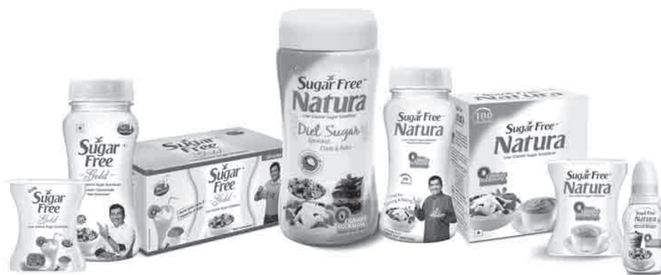
*Range of Sugar Free products