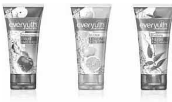
*Everyuth Face wash with new packaging

To address the challenges in the Face Wash segment , Everyuth re-launched its Face Wash range with fresh, new and contemporary looking packaging in March '16. This re-launch will be supported by communication across mediums. Focus in 2015-16 was also to further strengthen the Everyuth Tulsi- Turmeric variant in the market.